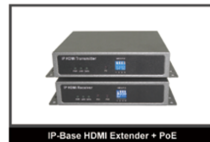
IP-Base HDMI Extender + PoE