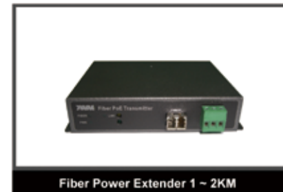
Fiber Power Extender 1 - 2KM