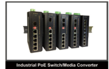
Industrial PoE Switch/Media Converter