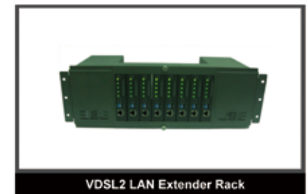
VDSL2 LAN Extender Rack